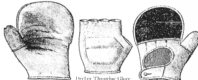
Decker Mitt, Front.